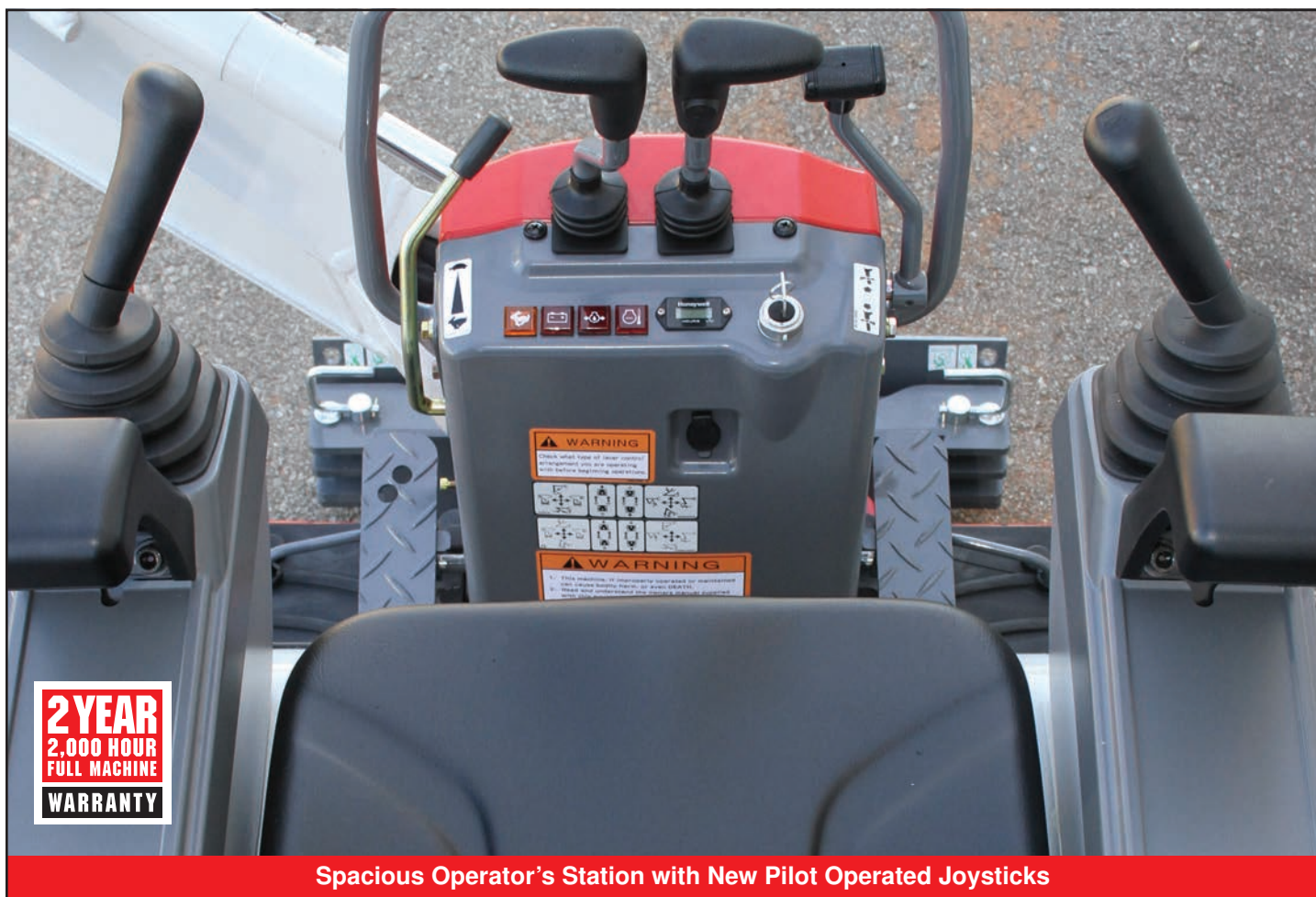
Spacious Operator's Station with New Pilot Operated Joysticks

To reduce the likelihood of rear swing impacts, the TB210R also features a short tail swing design. Despite its compact dimensions, service access is exceptional thanks to the tilt-up seat pedestal and access panels.