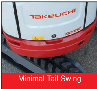
Minimal Tail Swing