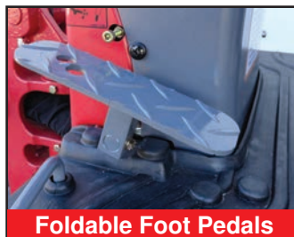
Foldable Foot Pedals