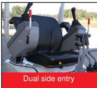
Dual side entry