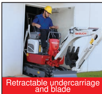
Retractable undercarriage and blade